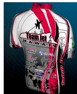
2010 Team Jet jersey (back)

http://custom.sugoi.com/usa/eng/reviewTemplate?id=10407&code=7979